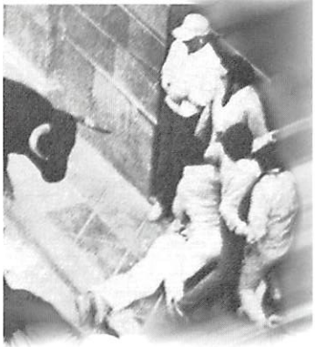
MICHENER AT PAMPLONA

three words speak volumes about a man who treasured his place in the world.